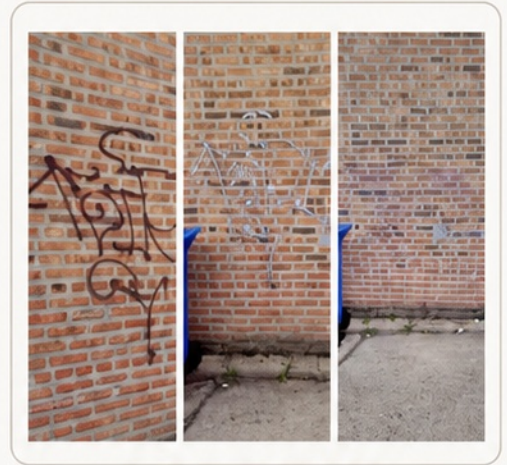
field sequence: tag -> scar -> blend

A fresh tag can become a signal that a wall is unclaimed. A blended repair sends a different signal: this boundary is watched, maintained, and worth respecting. Done carefully, the work preserves texture instead of escalating straight to abrasive cleaning, full repainting, or visual surrender.